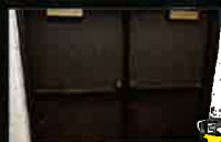
Replace with Fiber Reinforced Polymer Doors