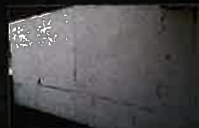
Repair Cracked Wall