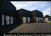
Replace Overhead Door Panels