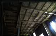
Replace Roof & Paint Structure